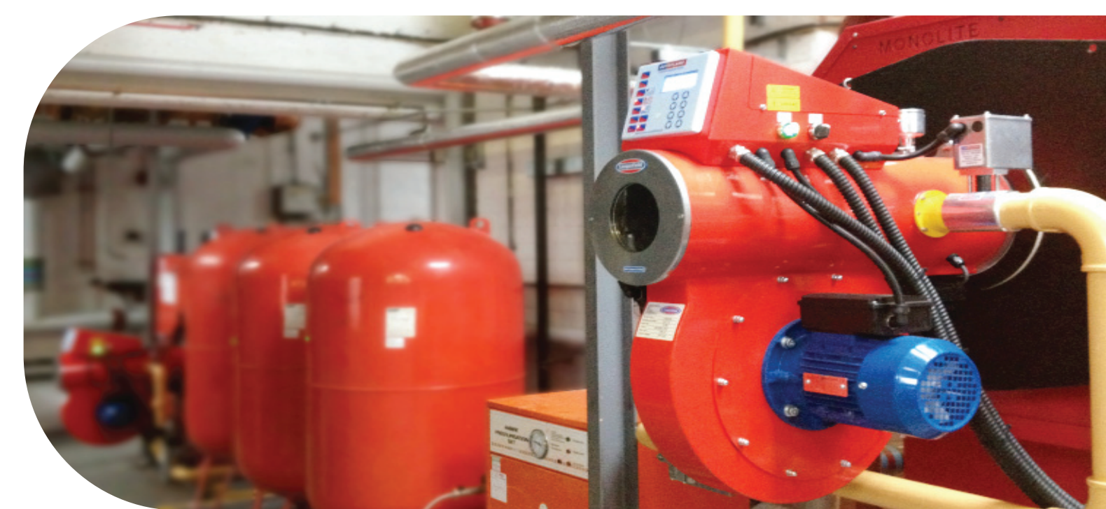
For more information on the Limpsfield burner range, please do not hesitate to contact us.

The project achieved a reduction of 10-12% of fuel usage within the first year and reduced the overall operating and potential maintenence costs as these burners are designed for easy maintenence. Due to the ease of installation of these burners, the project experienced very little downtime and commission to maximise efficiency.