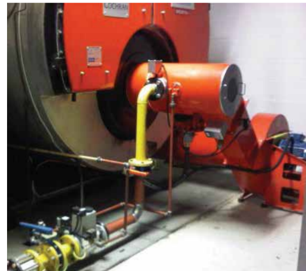
After: Limpsfield LCN36 burners using the existing Autoflame controls

Fuel savings were evident immediately as shown in the above graph which compares the combustion performance of the boiler house before and after the upgrade to Limpsfield burners. The annual savings achieved by the plant were calculated at 13% over the first year, meaning a fairly rapid payback period. Further benefits realised included a quieter boiler house and improved work environment. As a result of the success of this project, Coca Cola Enterprises (CCE) now recommend Limpsfield burners and Autoflame controls for all their sites.